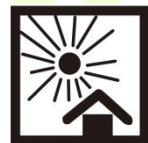
AVOID DIRECT SUNLIGHT EXPOSURE

The effective measuring angle of the temperature detection equipment is 25 degrees upward, downward, left, and right direction. Within this range, reflective objects/high-temperature heat sources should be avoided as much as possible. For example, glass, ceramic tile, metal, automobile, etc. The device's thermal imaging module can capture the reference objects within 10m. When the person crosses these reference objects and reaches the effective temperature detection distance, it is possible to detect the temperature of the reference body surface when the person passes the device in less than 0.1s, resulting in inaccurate temperature detection data. If the above situation exists, it is recommended that the person can stand in front of the device within the effective temperature detection distance for more than 0.5s to measure the temperature, so that the module can precisely capture the person's face and then measure the temperature accurately.