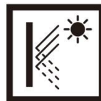
AVOID GLASS REFLECTION